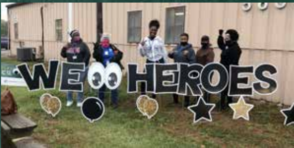
Photo from the "We See Heroes" signs posted at various TPS schools throughout the district. More to come this spring!

The school year may not look like any other, but we still see all the teachers and school staff working tirelessly, caring for your students, making a difference even if from a distance and doing your very best to make it all work. We appreciate you and believe you can do "virtually" anything. We C U and appreciate all you do!